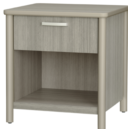
Model: ETNNS10CL 22.25W 21.5D 25H

Designed by Brian Graham, the collection seamlessly blends form and function, where minimalist design meets the complex needs of healthcare environments. Its soft edges and understated elegance create a serene, cohesive atmosphere that promotes healing and comfort. The collection offers practical storage solutions, including a wardrobe with a bench, a bench, several bedside tables—one featuring a mobile pouf—chests, and a mobile cart, all intuitively designed for ease of use. The durable Protea™ and Protea Fusion surfaces are engineered to withstand the rigors of healthcare settings, ensuring long-lasting performance.