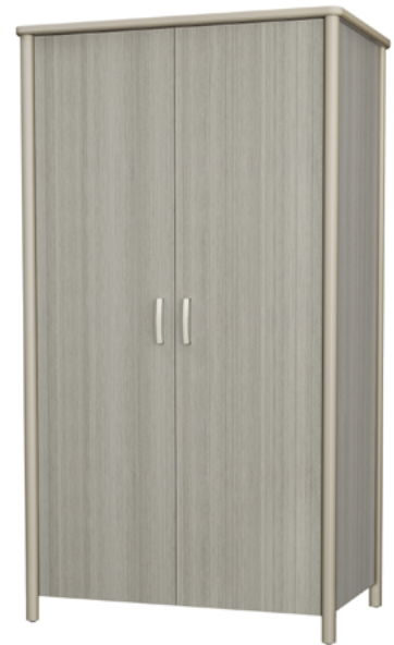
Model: ETNWR02CL 38.5W 24.25D 72H

Designed by Brian Graham, the collection seamlessly blends form and function, where minimalist design meets the complex needs of healthcare environments. Its soft edges and understated elegance create a serene, cohesive atmosphere that promotes healing and comfort. The collection offers practical storage solutions, including a wardrobe with a bench, a bench, several bedside tables—one featuring a mobile pouf—chests, and a mobile cart, all intuitively designed for ease of use. The durable Protea™ and Protea Fusion surfaces are engineered to withstand the rigors of healthcare settings, ensuring long-lasting performance.