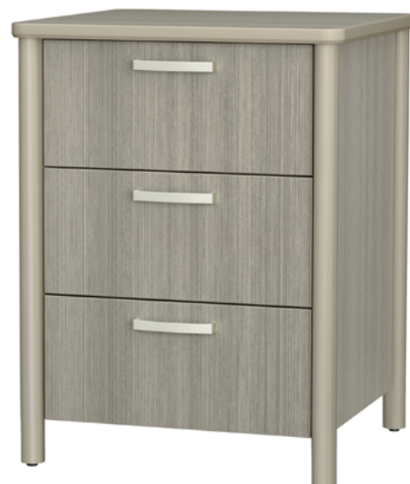
Model: ETNBS30CL 22.25W 21.5D 30.5H

Designed by Brian Graham, the collection seamlessly blends form and function, where minimalist design meets the complex needs of healthcare environments. Its soft edges and understated elegance create a serene, cohesive atmosphere that promotes healing and comfort. The collection offers practical storage solutions, including a wardrobe with a bench, a bench, several bedside tables—one featuring a mobile pouf—chests, and a mobile cart, all intuitively designed for ease of use. The durable Protea™ and Protea Fusion surfaces are engineered to withstand the rigors of healthcare settings, ensuring long-lasting performance.