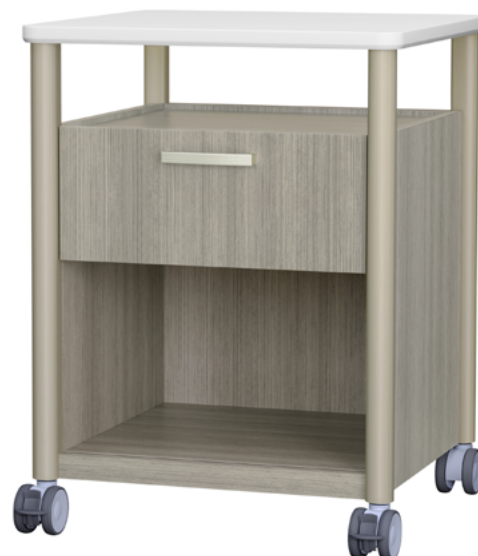
Model: ETNBS10FTSSCS 22.25W 21.5D 30.5H

Designed by Brian Graham, the collection seamlessly blends form and function, where minimalist design meets the complex needs of healthcare environments. Its soft edges and understated elegance create a serene, cohesive atmosphere that promotes healing and comfort. The collection offers practical storage solutions, including a wardrobe with a bench, a bench, several bedside tables—one featuring a mobile pouf—chests, and a mobile cart, all intuitively designed for ease of use. The durable Protea™ and Protea Fusion surfaces are engineered to withstand the rigors of healthcare settings, ensuring long-lasting performance.